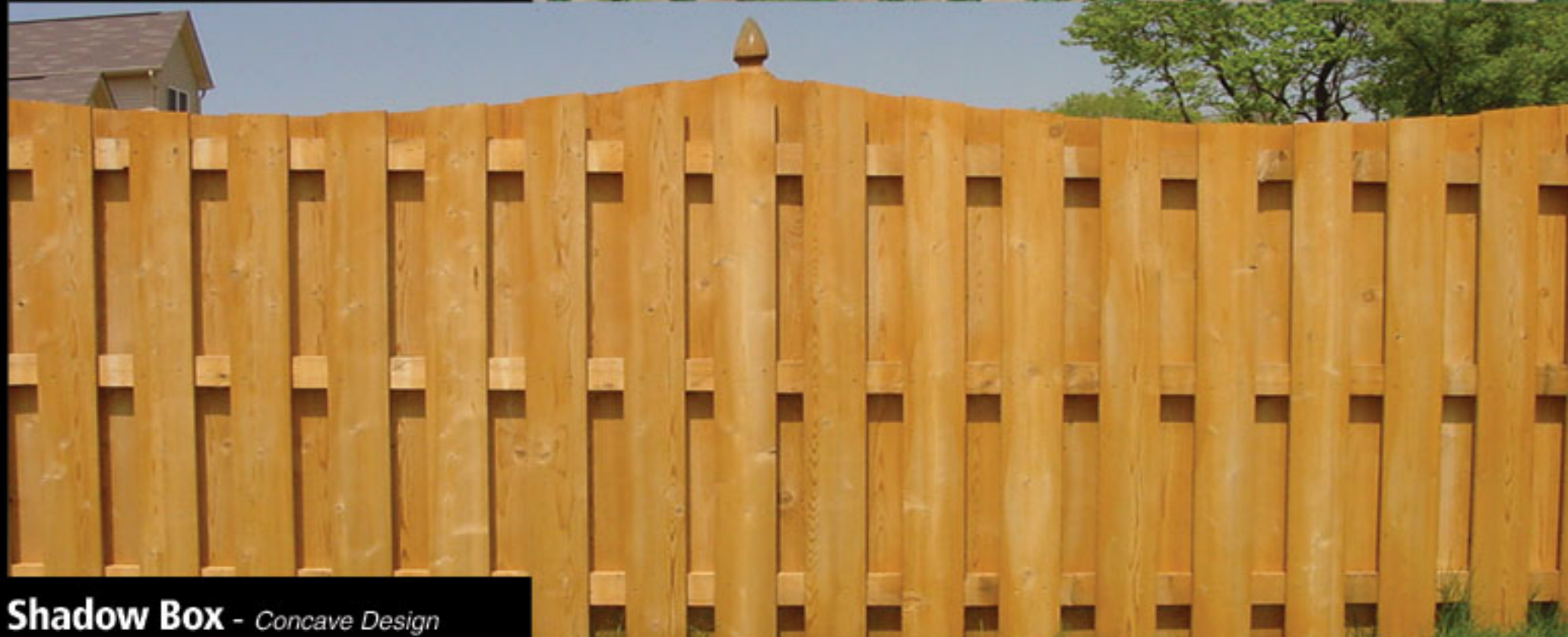
Shadow Box - Concave Design