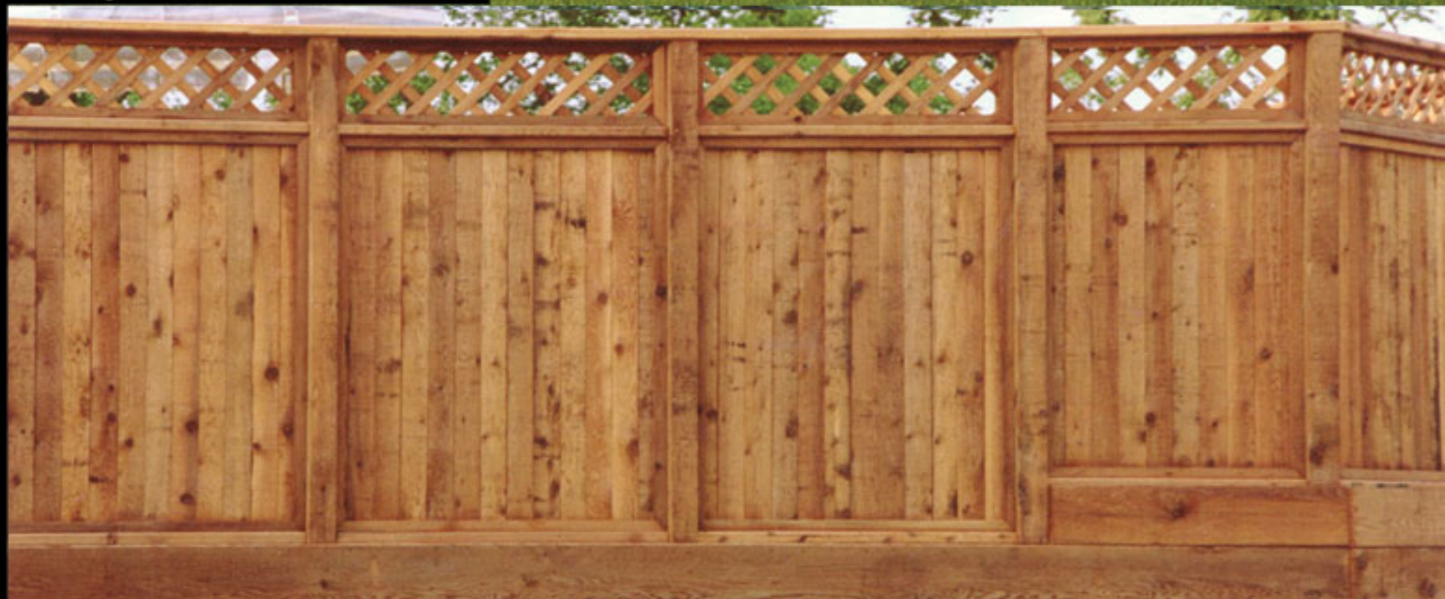
Lattice - with clear wood preservative