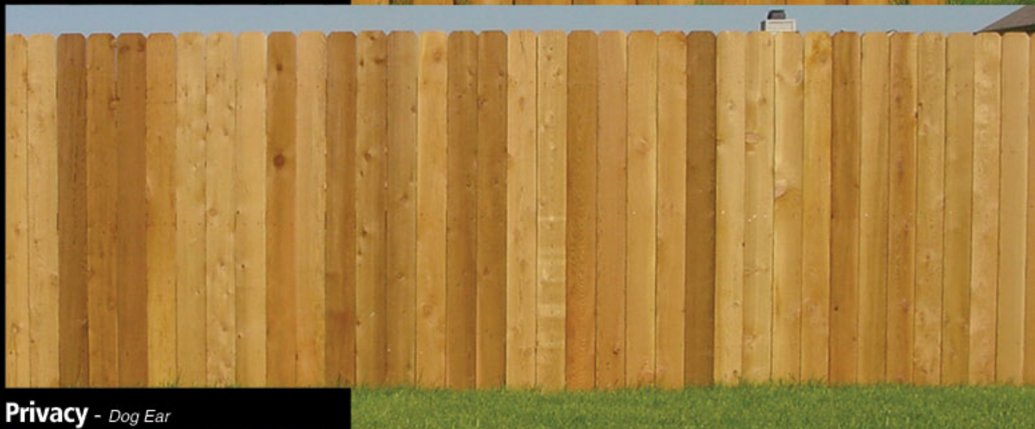
Privacy - Dog Ear